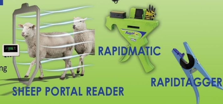
SHEEP PORTAL READER

The PM1 - Portal Reader is designed for reading sheep at speed. It's ideal for weighing, drafting or pregnancy scanning.