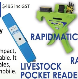
LIVESTOCK POCKET READER

The LPR - Livestock Pocket Reader is compact, lightweight and durable. It can BlueTooth to scales, printer, PC or your mobile.