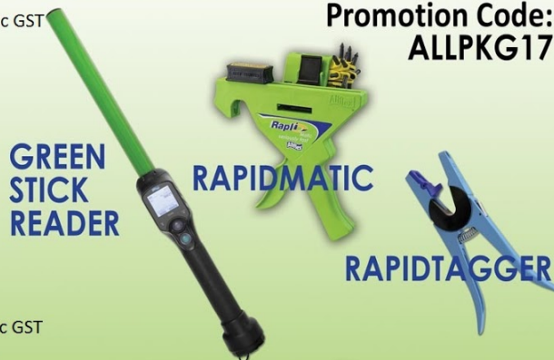
GREEN STICK READER

The RS420 - Green Stick Reader has BlueTooth and data entry features. With a longlife battery and a simple, two button control pad.